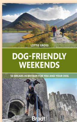
Dog-Friendly Weekends 9781784778774