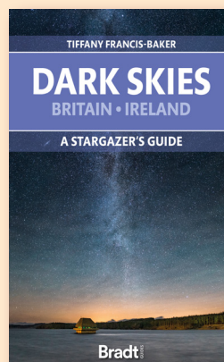
Dark Skies 9781784778354