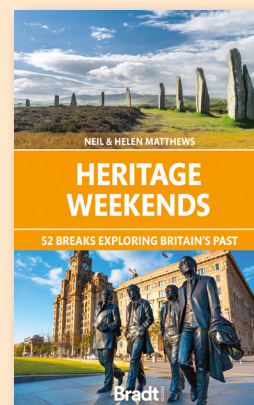
Heritage Weekends 9781784778439