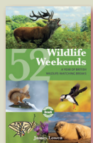
Previous edition cover